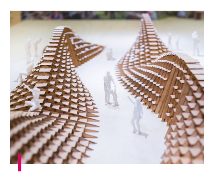
Exhibition "Multiplicidade" - National Museum of Contemporary Art

collectors, gallerists, artists and professionals from all over the world.