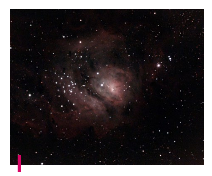
AstroCamp 2022 Academic Programme in astronomy and physics. Astronomy/Astrophysics Research Centre of the University of Porto