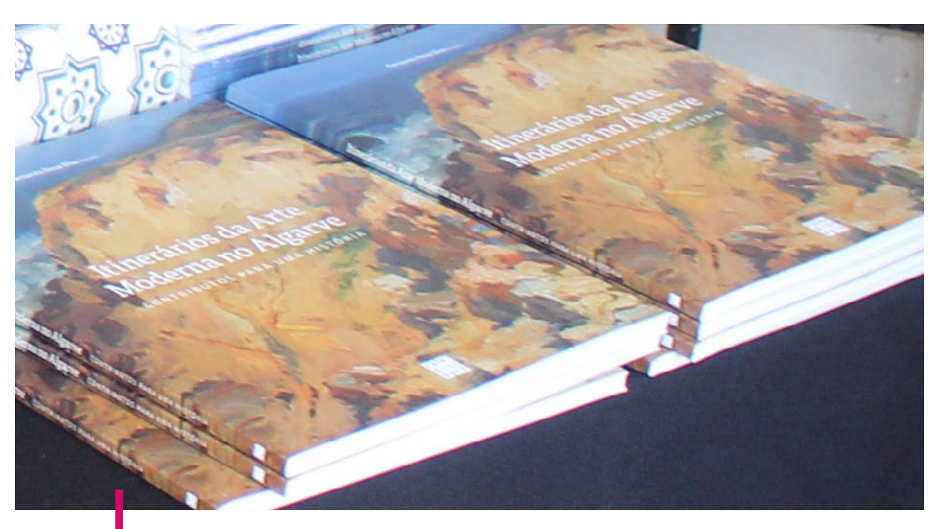
Exhibition "itineraries of painting/Modern Art". Faro Municipal Museum