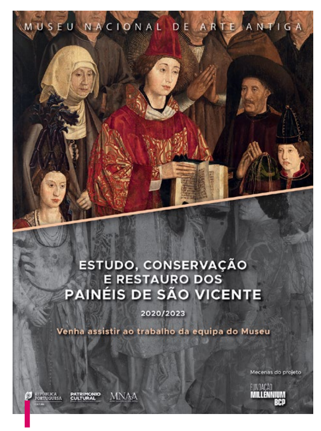
Conservation and restoration of the Painéis de São Vicente

at the end of the year. This initiative is part of the Bank's corporate social responsibility programme, developed in partnership with other areas of Millennium bcp.