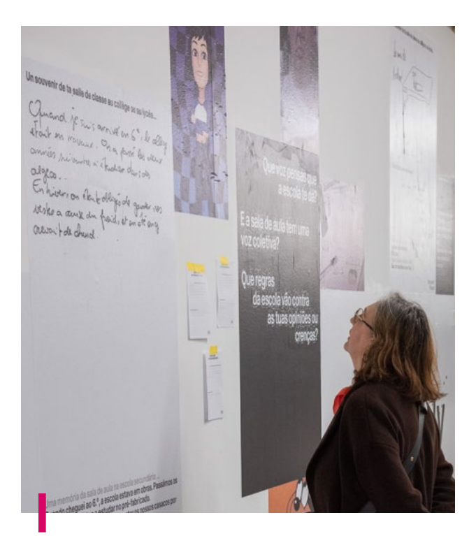
Lisbon Architecture Triennale - Garagem Sul. Centro Cultural de Belém