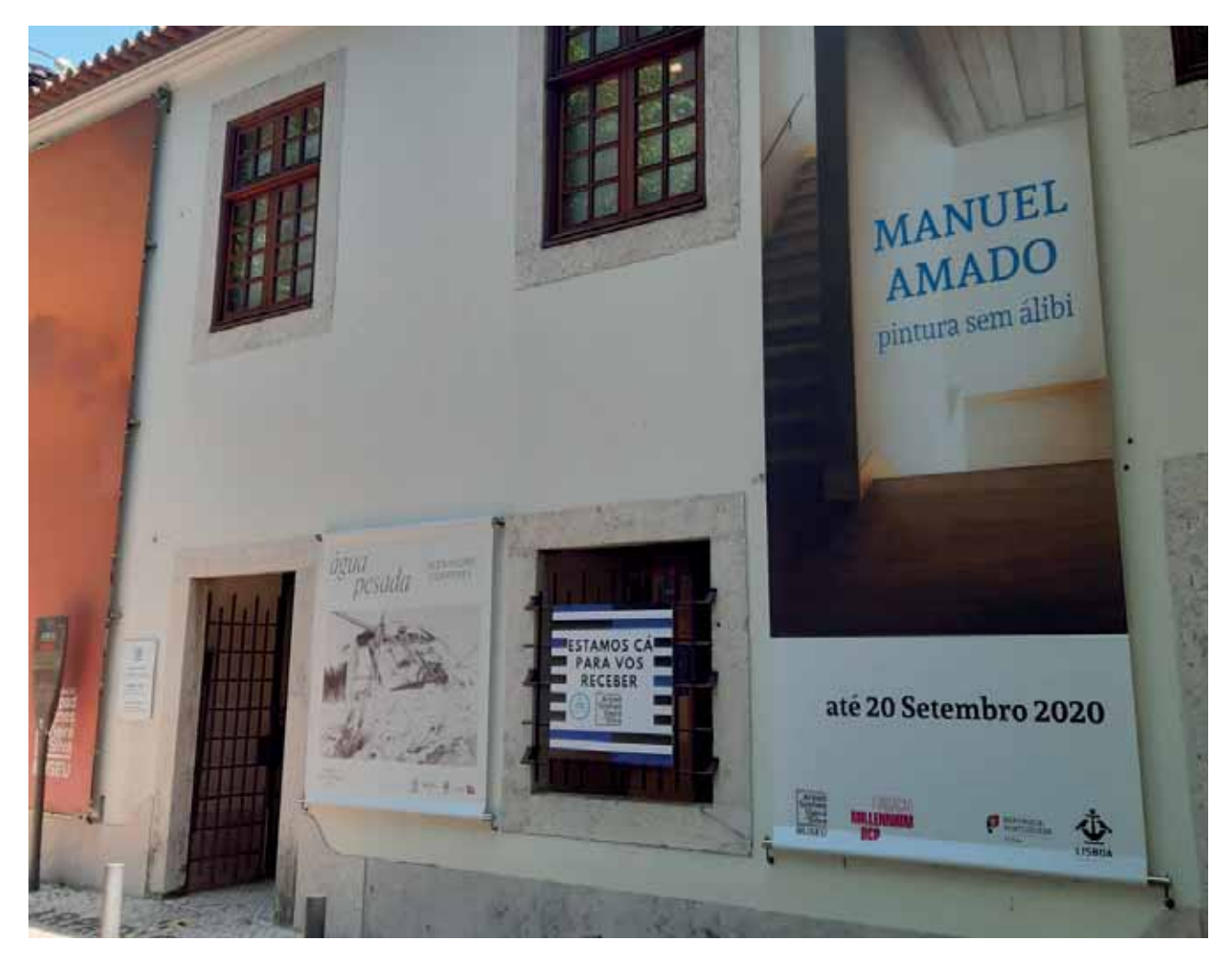
Exhibit "Manuel Amado – Pintura sem álibi", at Fundação Arpad-Szenes Vieira da Silva, in Lisbon.

The extension and depth of the impacts provoked by Covid-19, that led to a quite significant aggravation of the living conditions and isolation of the most fragile populations, gave rise to a special follow-up and support to the projects launched in order to mitigate the effects of this pandemic.