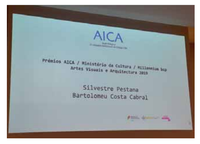
AICA/MC/Millennium awards of Visual Arts and Architecture.

→ Casa de São Roque – Support to the activities developed. Based on a program especially targeted at young students from the eastern part of Porto, the intention is to inspire young people and promote their full development, providing them with enriching cultural experiences. Modern Art serves as a starting point to an enriching experience, able of providing