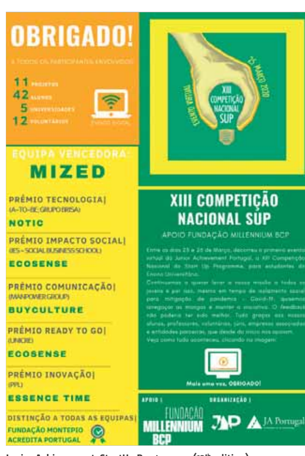
Junior Achievement: StartUp Programme (13th edition).