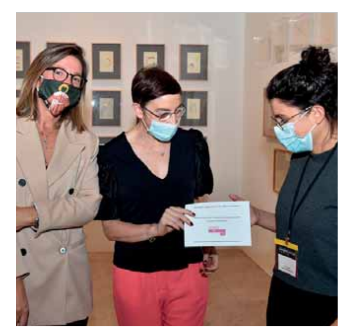
"Drawing Room Lisboa 2020".

14 to 18 October at Sociedade Nacional das Belas-Artes and its online session lasted until 30 October. Within the scope of this initiative, the following awards were granted: