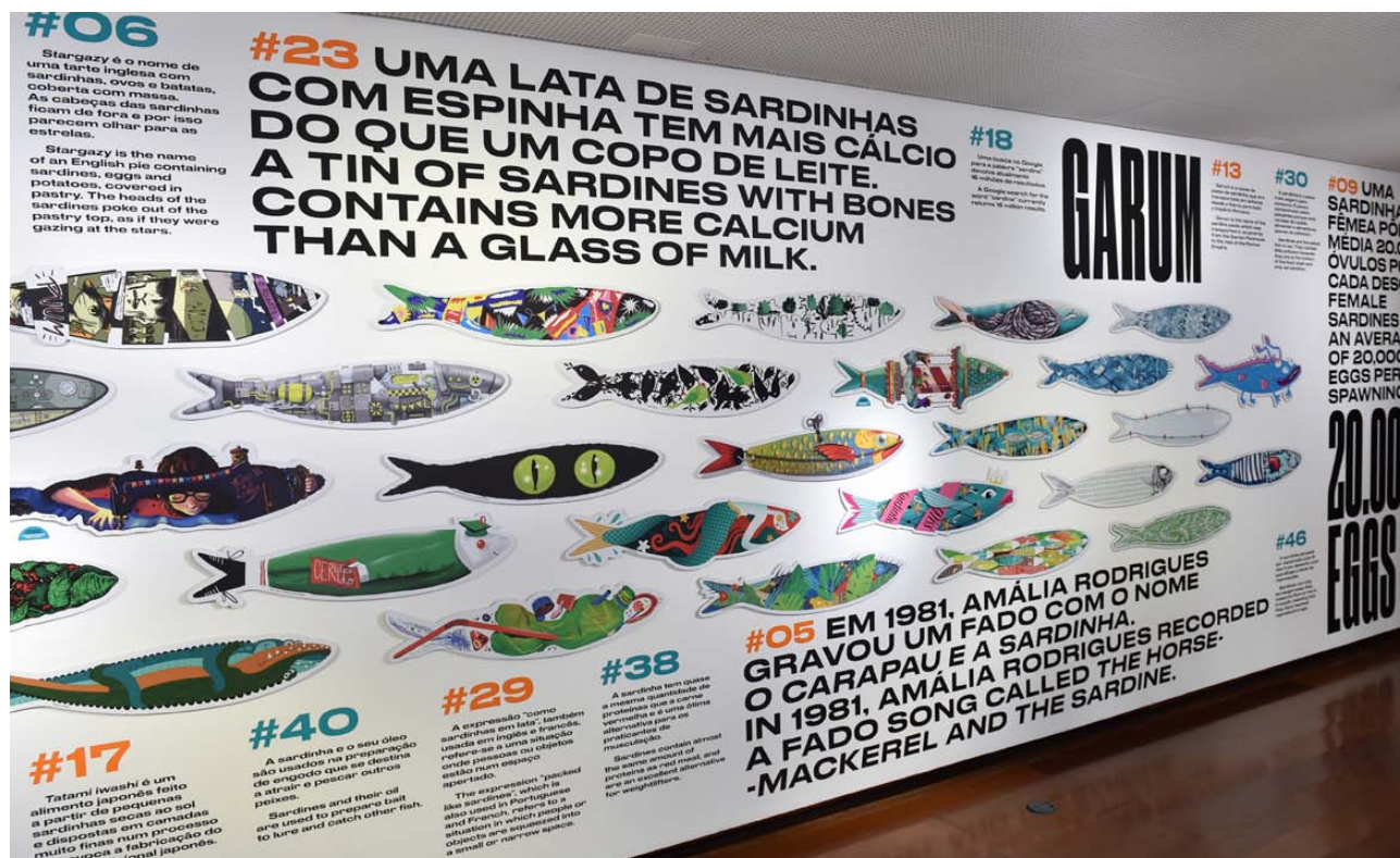
Exhibition Salvem a Sardinha , in the Millennium Gallery

In the Cultural area, we may highlight the following initiatives: