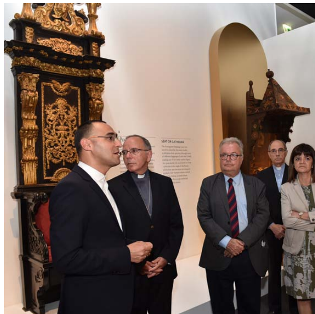
Support to the exhibit Rota das Catedrais at Palácio Nacional da Ajuda