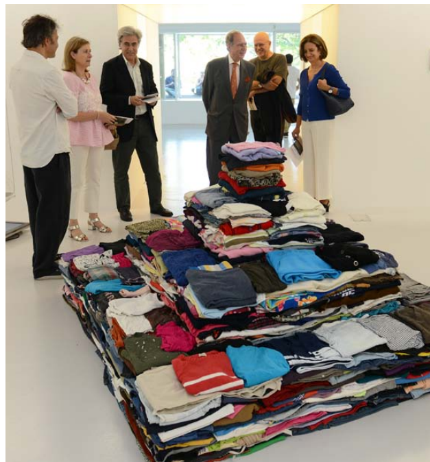
Movement for solidarity