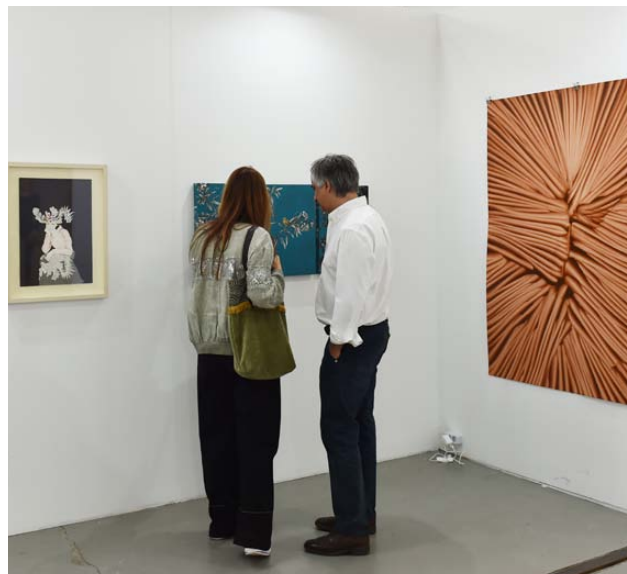
1 st edition of the contemporary art fair JustLX