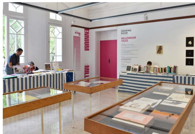
Support to the 1 st edition of the Drawing Room in Portugal

património cultural (The restorer – a profession belonging to our art heritage).