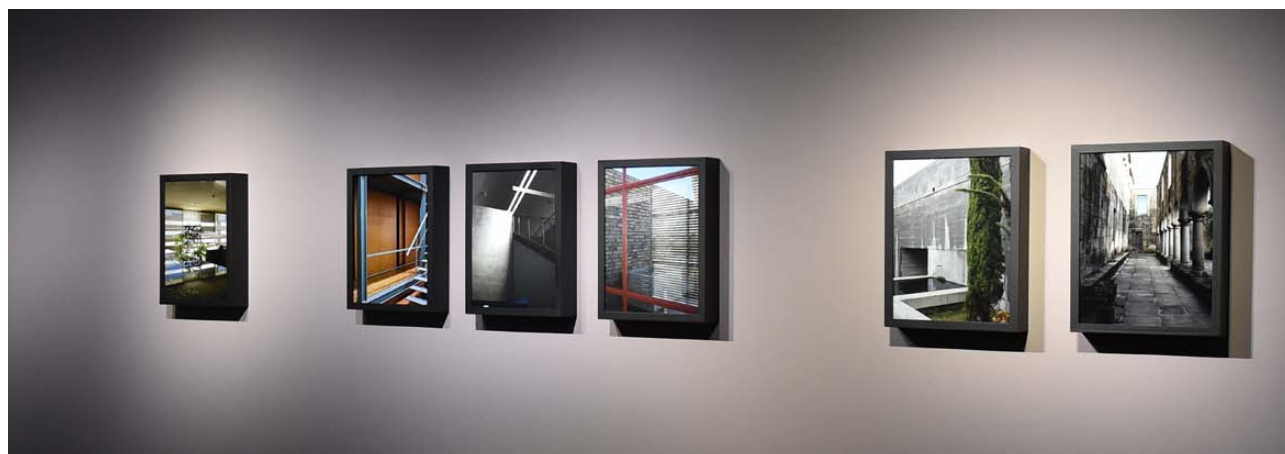
Exhibition Poesia Mineral, Eduardo Souto Moura