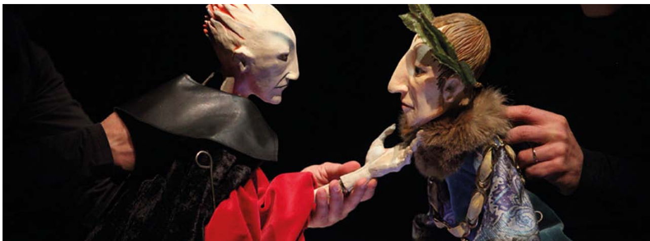
Puppet Theatre of Porto: support to the edition of the book celebrating the 30 th anniversary of the Theatre