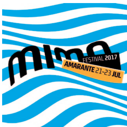
Festival Mimo 2017 had 196 participants.