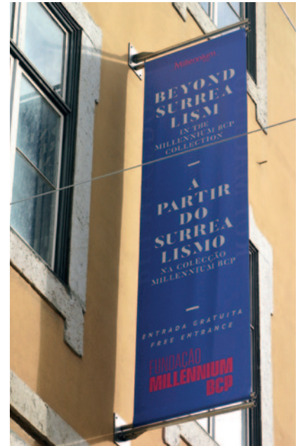
Beyond Surrealism includes works of art from eight artists of the Millennium bcp Collection.

THE FOUNDATION FOCUSES ITS ACTIVITY MAINLY ON CULTURE.