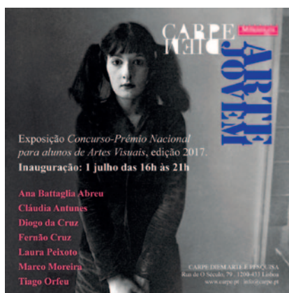
National award Young Art aims to disclose new artists.