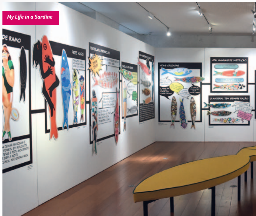
My Life in a Sardine