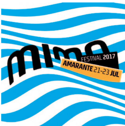
Festival Mimo 2017 had 196 participants.